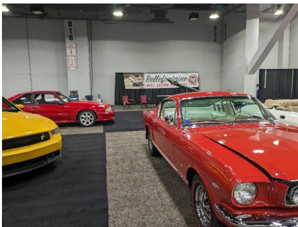
Tri-State Mustang Club

In the Collectors & Classics area enthusiast events had a place of prominence; the interest in participating was more than encouraging. The Hill Climb, the Red Brick Reunion Porsche Show, British Motorcycle Show and Dynasty Auto Events generated excitement along with the cars. New Car Shows have been navigating a changing landscape especially over the last few years. Gone is the manufacturer's support, concept cars are revealed online in a digital form rather than in a physical setting: now the dealers are expected to build the excitement. Many attendees are young and excited about cars in general including the classics and collector cars they seldom get exposed too. We are fortunate that the Greater Cincinnati Auto Dealers Association sees value in the enthusiast community and support the efforts of the clubs and organizations that serve that community. The Auto Expo is an opportunity for enthusiast groups to support the area auto dealers that support the hobby.